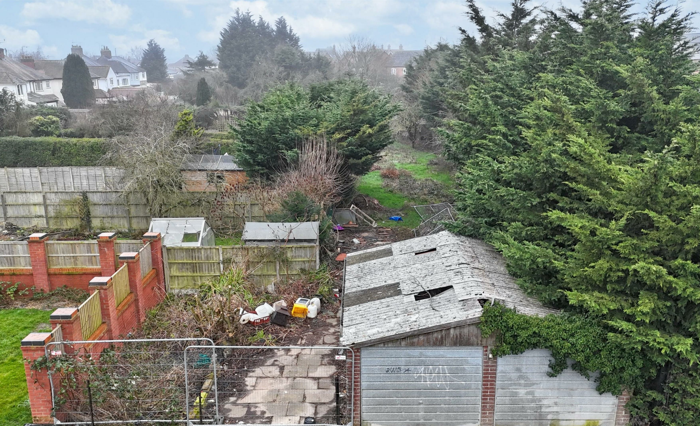
The Longshoot, Nuneaton, CV11 6JW